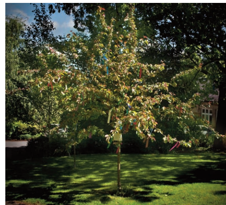
The Memory Tree at Whirlow Grange where those who attend tie ribbons in memory of their loved children.

A small number of day visitors may be allowed - price to be confirmed