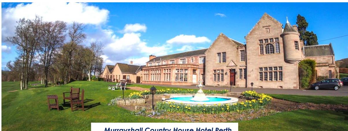
Murrayshall Country House Hotel Perth

A warm and supportive weekend for all bereaved parents, siblings and grandparents from across the UK.